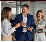
Level 1 / Level 2 Examiners' Report

Engineering (Technical Award) Level 1/2 Summer 2024